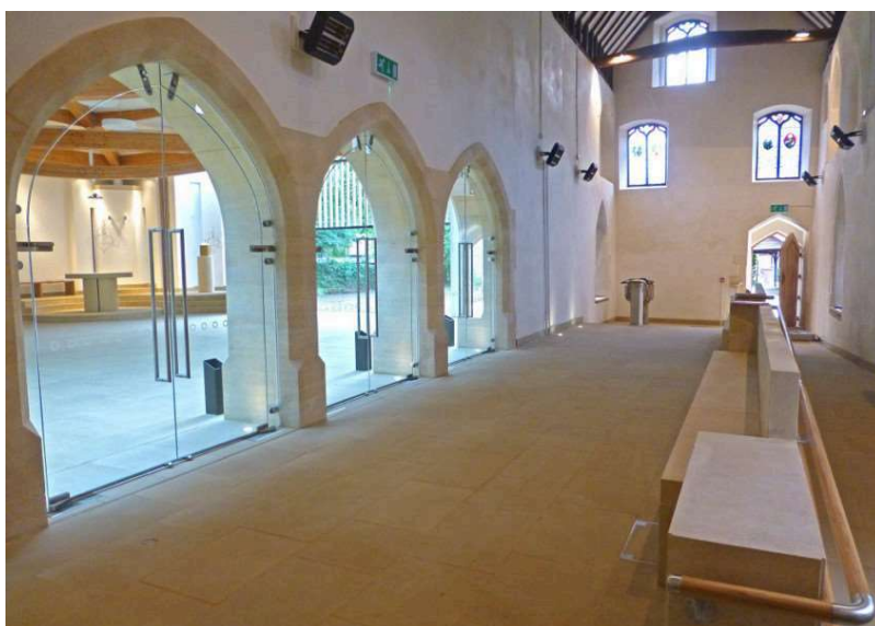
The chapel at Clare Priory

As this electronic newsletter drops into your Inbox, I expect to be on the second day of a silent retreat at Clare Priory in West Suffolk in preparation for my licensing in St Edmundsbury Cathedral next Saturday (27th) as a Lay Minister at St Margaret's.