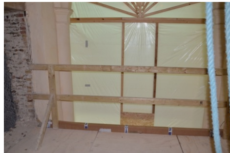
Left From below